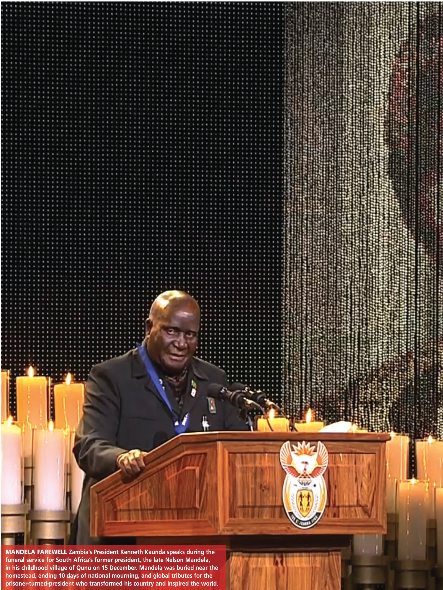
MANDELA FAREWELL Zambia's President Kenneth Kaunda speaks during the funeral service for South Africa's former president, the late Nelson Mandela, in his childhood village of Qunu on 15 December. Mandela was buried near the homestead, ending 10 days of national mourning, and global tributes for the prisoner-turned-president who transformed his country and inspired the world.