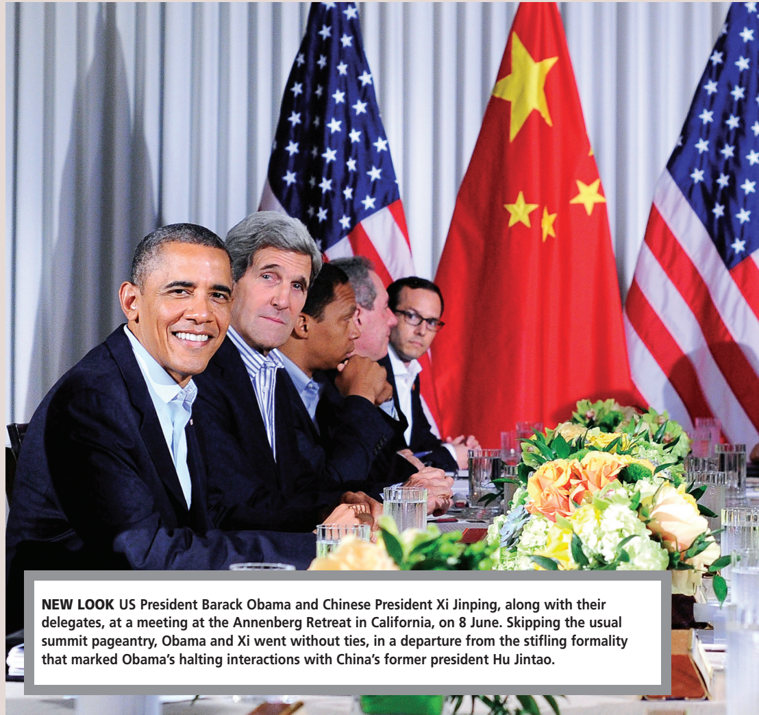
NEW LOOK US President Barack Obama and Chinese President Xi Jinping, along with their delegates, at a meeting at the Annenberg Retreat in California, on 8 June. Skipping the usual summit pageantry, Obama and Xi went without ties, in a departure from the stifling formality that marked Obama's halting interactions with China's former president Hu Jintao.

smoothly, while ensuring that the national interests of both countries do not collide, but can be harmonised in the interests of global peace and stability.